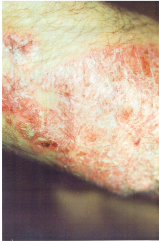
ARM 1: BEFORE TREATMENT