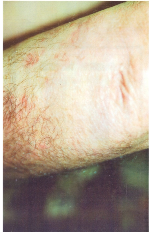
ARM 1: AFTER WEEK 4