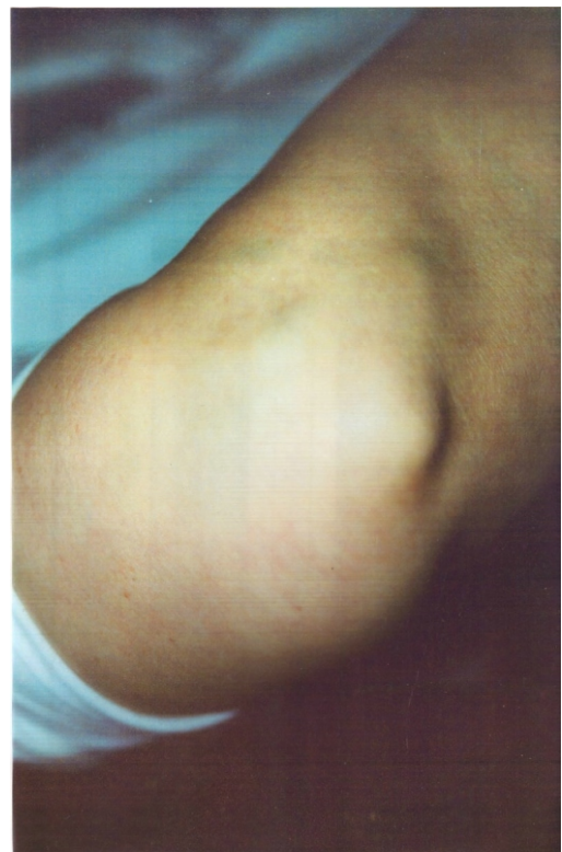
ARM 2: AFTER WEEK 6